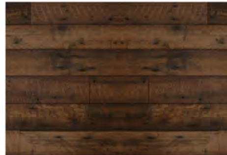
DARK RECLAIMED WOOD