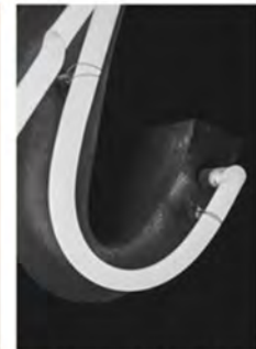
NEON LIGHT SIGN